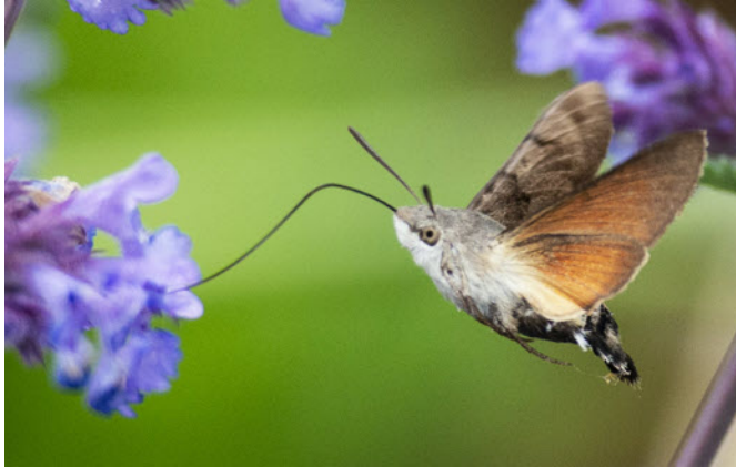
A moth drinking nectar.

The lack of insects has a dramatic affect on bird life as well. I'm sure many of you will have noticed the lack of swallows, house martins and swifts; these are all airborne insect feeders. For heaven's sake I've found myself getting so excited this year when I saw a swift. Years ago you would see dozens in all villages and towns diving and swooping with that characteristic scream.