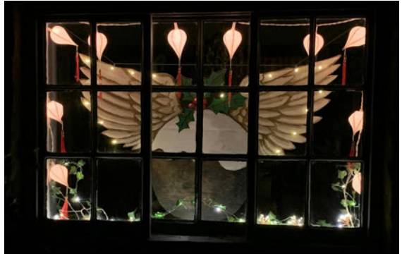
A small collection of Oxhill Advent window displays from 2021